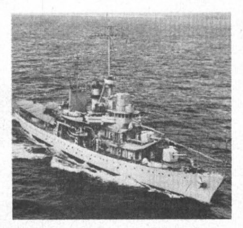
USS ERIE (PG 50) — Deck logs show no admiral was lost at sea aboard this gunboat.

• Smooth deck logs of USS Erie (PG 50) do not show that an admiral was lost at sea while this vessel was stationed at Panama Canal Zone. However, this vessel was a unit of the Guadalcanal Support Force on 12 and 13 Nov 1942 when Japanese shells ripped the superstructure and bridge of the flagship USS Atlanta (CL 51), killing Admiral Norman Scott, USN, on board that vessel. – ED.